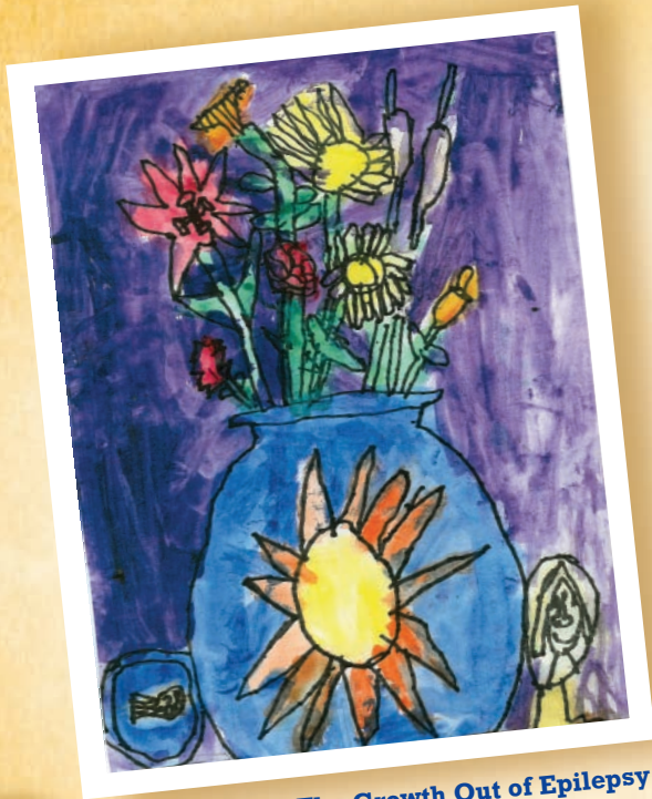
The Growth Out of Epilepsy

Expressions of Courage ® is a national art contest for people with epilepsy. The contest showcases the talent and inspiration of people across the country living with the condition. For people living with epilepsy, art can serve as a visual demonstration of the feelings of living with epilepsy. From a finger painting on a sheet of paper to an intricate drawing on a canvas, art provides an opportunity for people with epilepsy to vibrantly convey how they live with the condition.